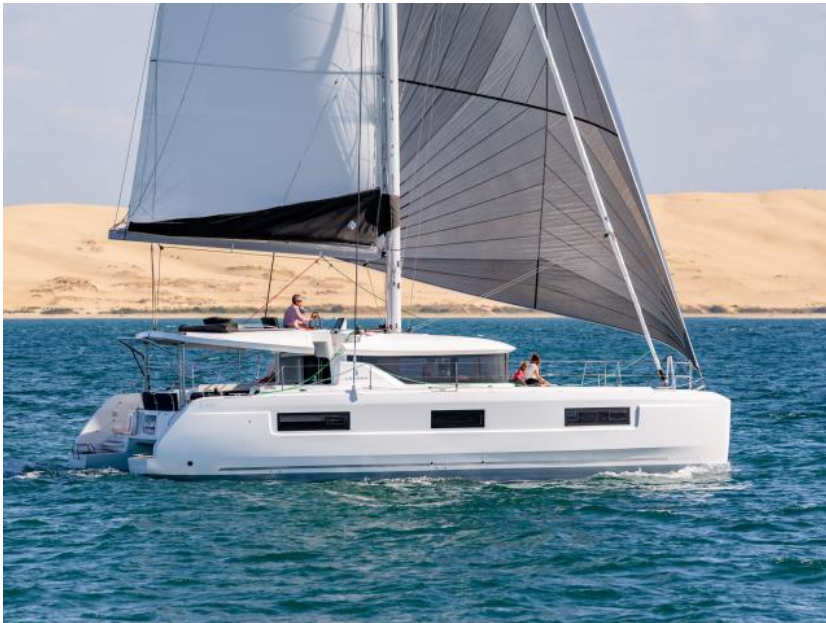
Lagoon 46